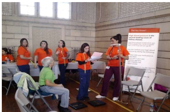
BMA students volunteering at National Kidney Foundation Free Kidney Disease Screening on March 2015.

During the course of training, students may participate in a number of training-related experiences in addition to their classroom instruction. These activities include, but are not limited to, guest speakers, field trips, mock interviews, on-site visits, and workshops/presentations. These activities are considered to be an integral aspect of training. To successfully complete the BMA program, students are expected to achieve a minimum typing NWPM (net words per minute); to provide a satisfactory employment portfolio including a resume and mock interview summaries; and to take a post placement test.